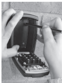
Using the pencil mark the position of the screw holes to be drilled